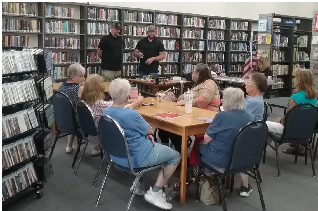
Listen and Learn attendees @ Scott City found out about preparing your vehicle for winter from Graham Auto Service