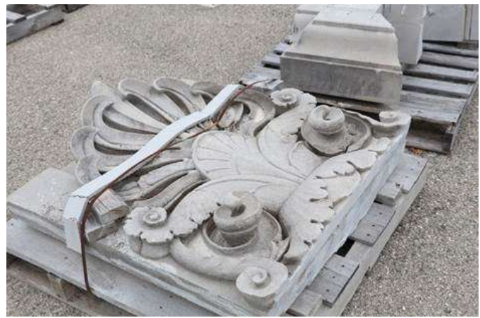
Missouri State Capitol Commission Presents Historic Capitol Stone Auction