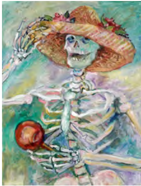
Commemorating the Day of the Dead, this exhibit's labels are also in Spanish.